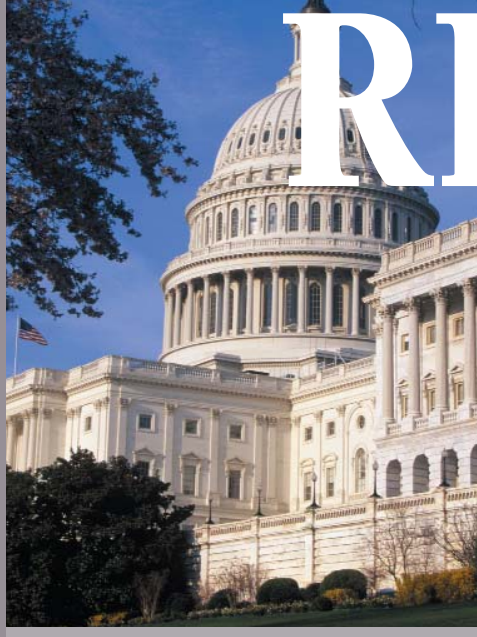
Magazine of the Baptist Joint Committee