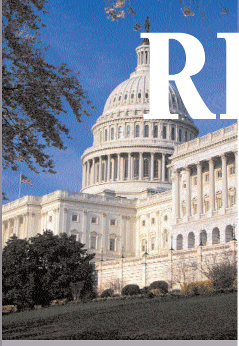
Newsletter of the Baptist Joint Committee