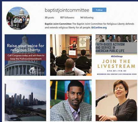
Follow the BJC on Instagram! We are @baptistjointcommittee.