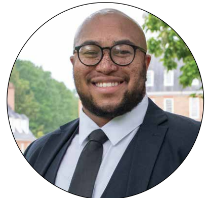
Minister Bobbie Newell Jr. Richmond, Virginia

As we navigate the complexities of our interconnected world, the call to action for safeguarding religious freedom becomes even more urgent. By championing this cause, we send a resounding message that we refuse to accept a world where prejudice and discrimination define our interactions.”