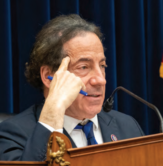
Violent white supremacy is part of “the most serious domestic terror threat facing our people,” said Rep. Jamie Raskin, D-Md., who served as the chair of the subcommittee.