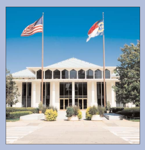
The North Carolina State Legislative Building in Raleigh is the home of the state House of Representatives and Senate.

Constitutionality aside, legislative prayer during official government meetings remains controversial for many religious liberty advocates. "Just because something is constitutional does not make it right," said K.