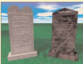
This illustration from Sumnum shows its proposed "Seven Aphorisms" monument (right) next to a Ten Commandments monument.

6 Supreme Court's Sumnum decision avoids direct church-state question In a case involving a permanent religious display in a public park ( Pleasant Grove City v. Sumnum ), the U.S. Supreme Court ruled unanimously that the freedom of speech protected by the First Amendment did not require a Utah town to allow members of the Sumnum faith to construct a religious monument next to a Ten Commandments monument, because, they argued, the permanent displays in the park are government speech and not private speech. Left unresolved is the way this determination relates to the separation of church and state. Justice Antonin Scalia assured local governments that this ruling does not "propel (them) from the Free Speech Clause frying pan into the Establishment Clause fire."