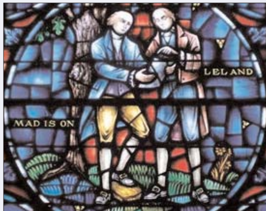
This stained glass window at First Baptist Church in Richmond, Va., depicts Baptist leader John Leland discussing religious liberty with James Madison, the author of the First Amendment.

The historic Baptist commitment to religious liberty is centered on our freedom to worship God and to follow Christ without efforts by the government to advance or restrain religion. We believe it is a gift from God and not the result of any act of toleration or concession on the part of the state. God has made us all free — free to say yes, free to say no, and free to make up our own minds about our spiritual destiny. The fight for religious liberty is an effort to prevent the government from doing what even God will not do: coerce faith. The expression of this Baptist ideal began 400 years ago, and we all have a role and responsibility to make sure others enjoy religious freedom through the next 400 years and beyond.