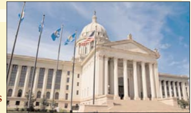
The Oklahoma state capitol will soon have a Ten Commandments monument on its grounds.

9 Ten Commandments displays in Oklahoma While the state legislature was voting to place a Ten Commandments monument on the grounds of the state capitol, the 10th U.S. Circuit Court of Appeals ruled that a Decalogue monument in Haskell County was unconstitutional. That ruling has been appealed to the U.S. Supreme Court. Meanwhile, Oklahoma Gov. Brad Henry signed legislation that paves the way for a Ten Commandments monument to be placed on the state capitol grounds, despite the urging of the BJC and other religious liberty groups to veto it.