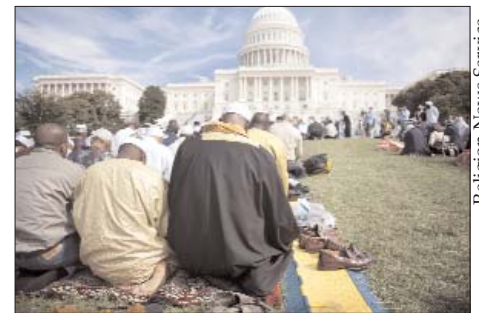
Muslims gathered on Sept. 25 at the U.S. Capitol for the "Islam on Capitol Hill" prayer rally.