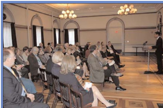
Paul Monteiro from the White House Office of Public Engagement addresses members of the BJC Board in the Eisenhower Executive Office Building. Representatives from the National Security Council, U.S. Commission on International Religious Freedom and Department of Justice gave a briefing on the latest issues concerning religious liberty.