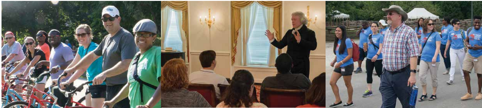
From left to right: The 2015 BJC Fellows enjoy a bike ride; A Colonial Williamsburg interpreter portraying Thomas Jefferson speaks to the 2016 BJC Fellows; the 2017 BJC Fellows take a guided tour of Colonial Williamsburg, focusing on religious history.

Visit BJCOnline.org/Fellows for more information and application materials. The deadline to apply for the 2018 class is February 16. To learn more about the experience, visit our website or search #BJCFellows on social media.