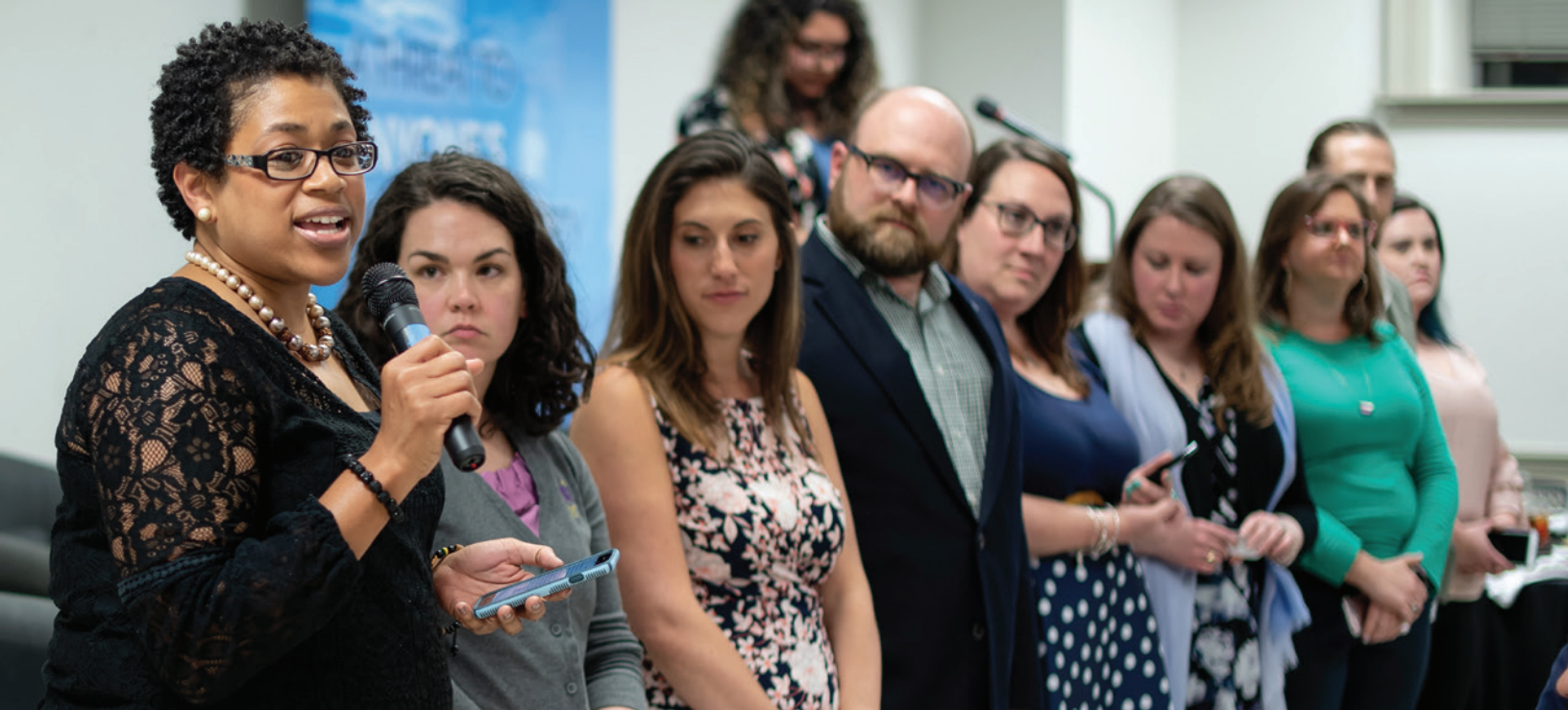
Several BJC Fellows shared during the event.

to do that in a manner that is unobstructed by the legitimate powers of the state, and unobstructed by fellow citizens who may disagree with that particular practice.”