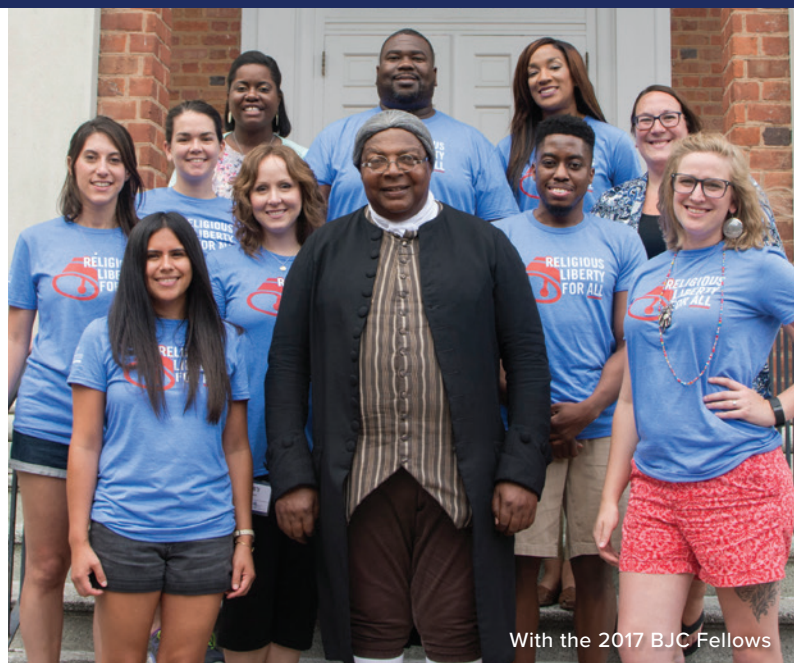
With the 2017 BJC Fellows

African Americans, especially enslaved people and free black people [and others], to join the Continental army. He was definitely a staunch patriot, mainly because he was trying to get people to understand the necessity of winning the war against Great Britain to bring about religious liberty.