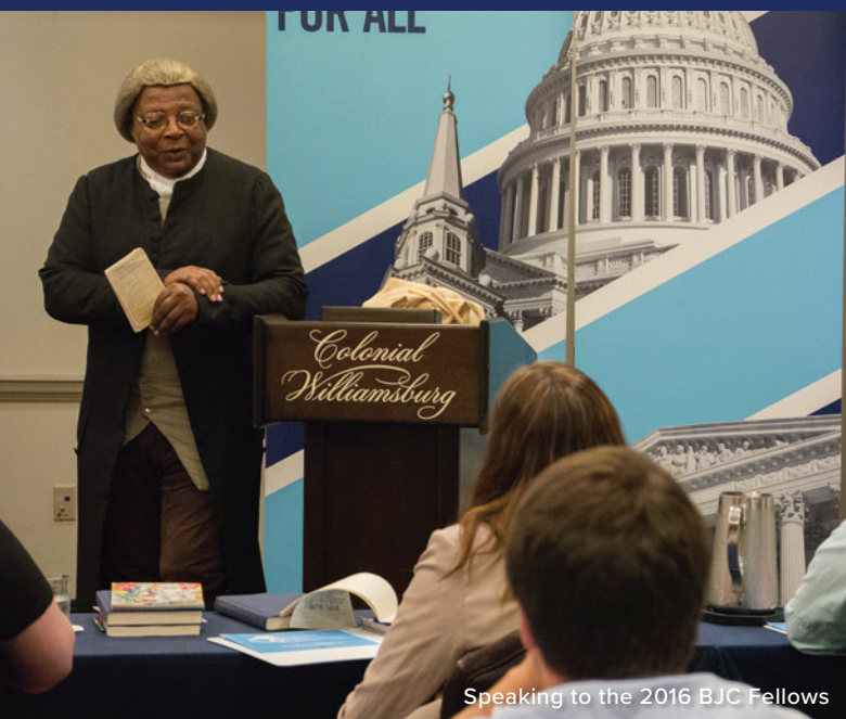
Speaking to the 2016 BJC Fellows