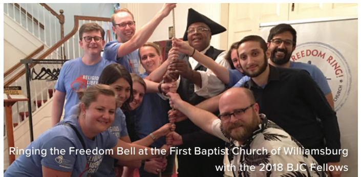
Ringin' the Freedom Bell at the First Baptist Church of Williamsburg with the 2018 BJC Fellows

For more information about The Colonial Williamsburg Foundation in Williamsburg, Virginia, visit their website at ColonialWilliamsburg.com . To learn more about the BJC Fellows Program, visit our website at BJCOnline.org/Fellows .